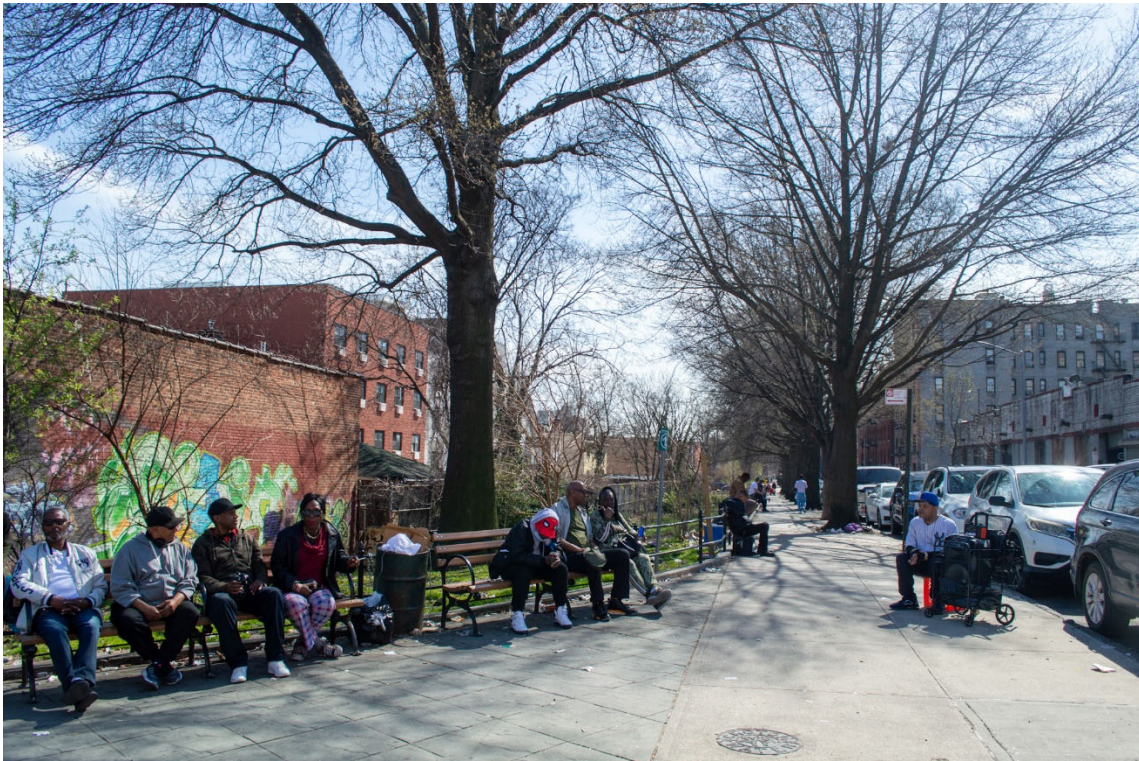
Aqueduct Walk, entrance and path, southern entrance on West Kingsbridge Road, 2024