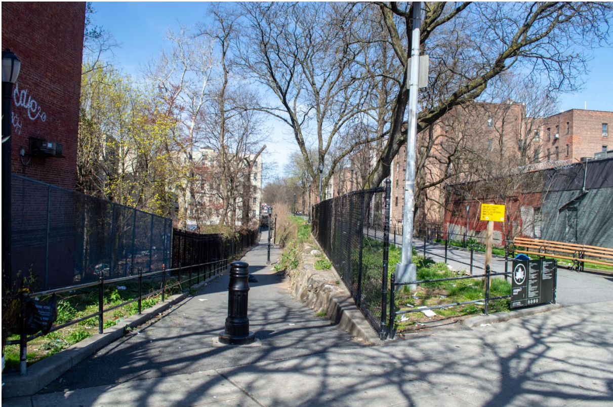
Aqueduct Walk, entrance and path, northern entrances on West Fordham Road, 2024