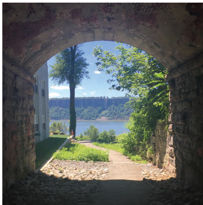
The view west, framed by the Quarry Trail's passage under the Warburton Ave. bridge.