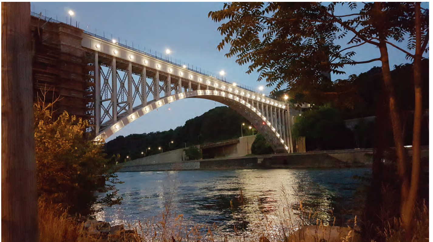
Photo Gallery • The steel span of the High Bridge, illuminated.