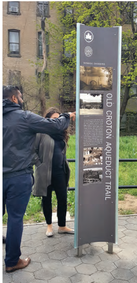
Sign kiosk on the Aqueduct, above the north side of Burnside Ave.

The locations are: NYC boundary, Van Cortlandt Park South, Jerome Park Reservoir, Aqueduct Walk (Aqueduct Lands), Burnside Ave., University Malls, and the Bronx end of the High Bridge.