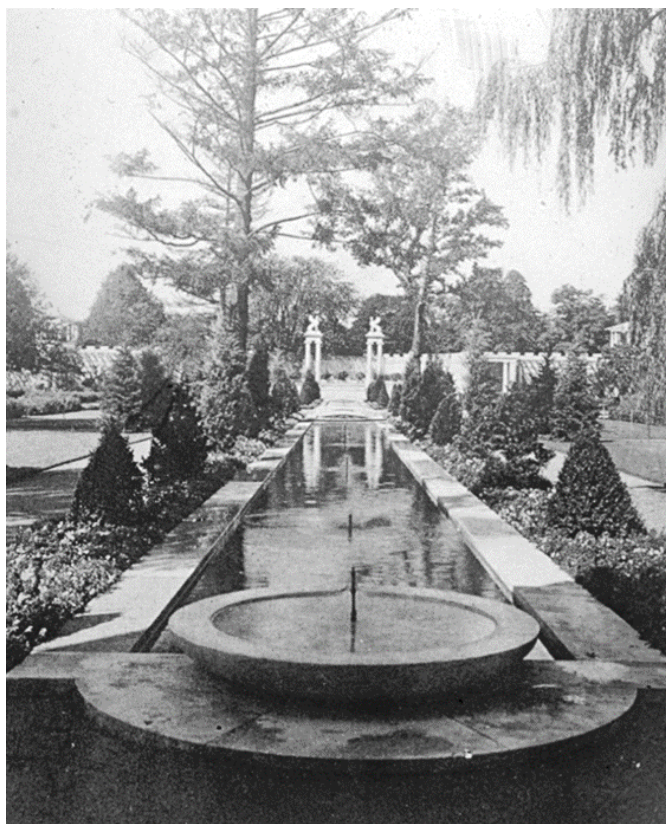
Partial view of Untermeyer's gardens, c.1940

After the gardens at Greystone were established, as many as sixty gardeners were employed for their upkeep. These gardeners gained the expertise that was later