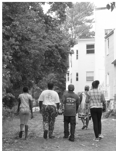
The north end of the reclaimed section at Lamartine Ave. (left), and the south end at Bishop William J. Walls Place (right) in Yonkers.